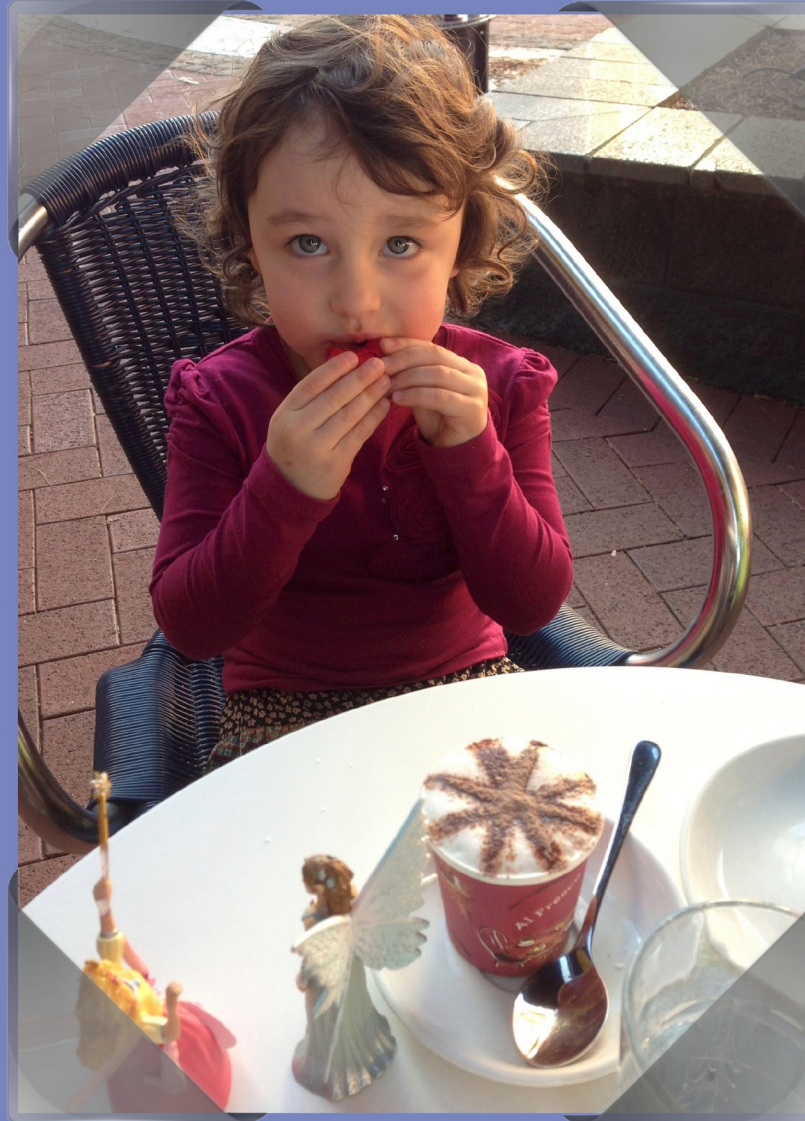
Once upon a time when Quinn came to Perth